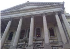
Illinois State Capitol AIA Prairie Grassroots