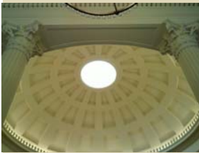
Illinois Old State Capitol AIA Prairie Grassroots