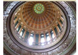
Illinois State Capitol AIA Prairie Grassroots

5431 International Dr Rockford, IL 61109 815.874.3933